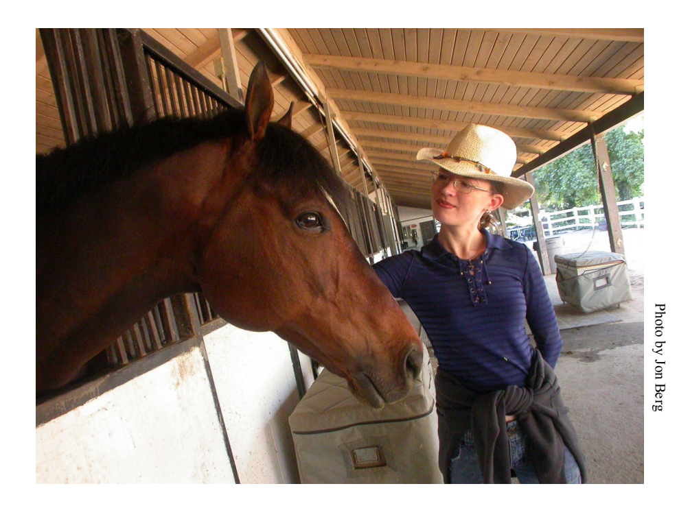
Let all your things be done with charity.